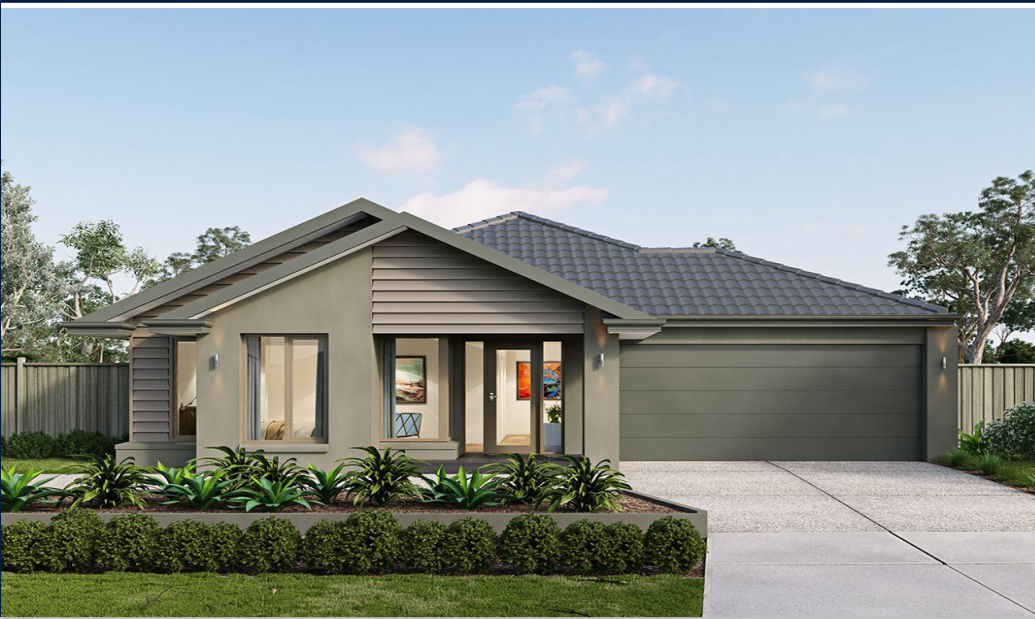
Price excludes: Fencing, Landscaping, Concrete pavers, Planter boxes, Decking