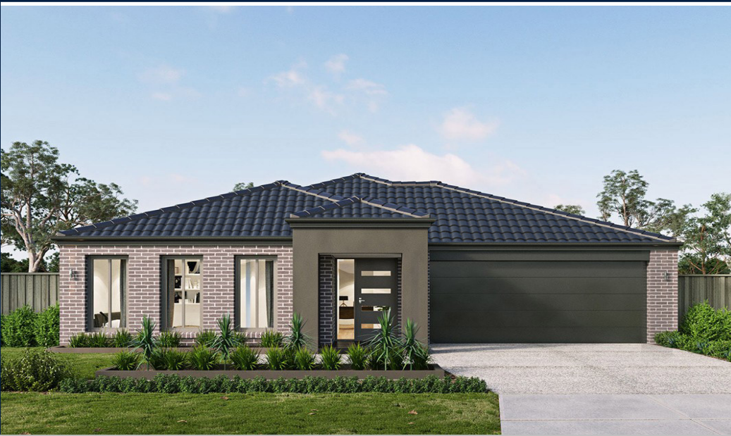
Price excludes: Fencing, Landscaping, Concrete pavers, Planter boxes, Decking